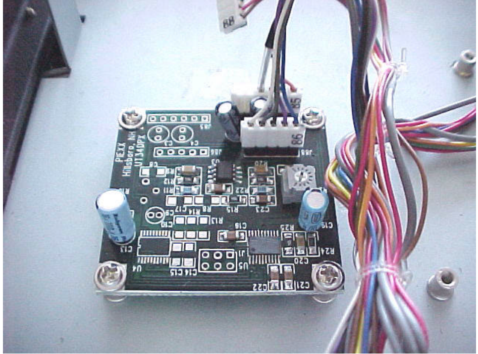
Fig 3. Installation of a Single Channel UT-34PX

4. If you are using a single channel UT-34PX you will need to decide if you want the tone board to be used with the main or sub channel. For use with the main channel, install harness connector 86 on UT-34PX connector J88 and, install harness connector 85 on UT-34PX connector J87 as shown in Fig. 3. If you would rather have the tone encoder function with the sub channel, install harness connector 88 on UT-34PX connector J88 and, install harness connector 87 on UT-34PX connector J87.